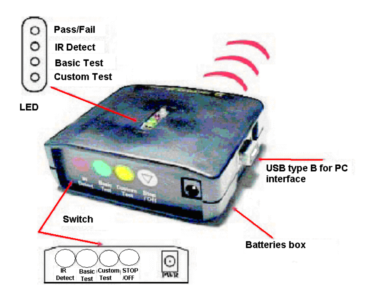
Fig. 1 ACT-IR3200M

Fig.1 is view of ACT-IR3200M. It has an USB type B connector on side, an IR window at the front and 4 LED on the top and two keys on the rear. It can work with IR3200SW or work alone. IR3200SW is software runs under PC's Windows system and it allows user to set up different baud rates B.E.R. test to DUT.